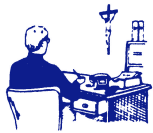
From Our Pastor's Pen

How do I describe this past weekend? First, the water supply system goes out and we have to get several volunteers in on Sunday to try and get water flowing correctly